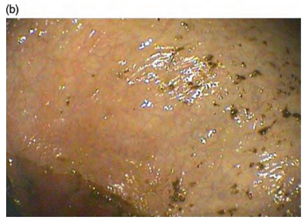
Figure 1. a. Ulcerated and eroded equine stomach at margo plicatus (dark red region) in greater curvature of the non-glandular region, b. Non-ulcerated stomach in same region and with the same magnification scale

once pharmaceutical treatment is discontinued, ulceration is likely to re-occur (Reese and Andrews, 2009), thus FPT and FED could provide a sustainable dietary treatment and prevention strategy to heal and avoid recurrence of gastric ulceration in susceptible horses.